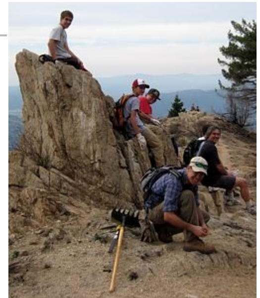
SoCal Interscholastic Cycling League riders take a break