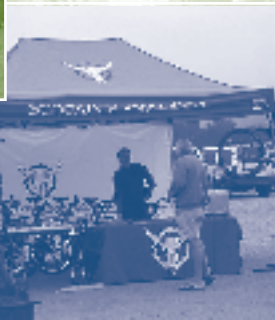
Tinker Juarez (Cannondale USA) chats up the crowd before leading a ride up Bulldog.